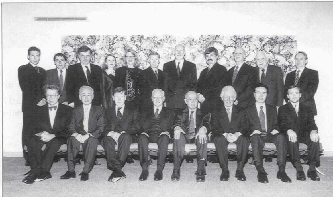
The Tribunal is seated in the first row, with the agents of Australia, New Zealand and Japan. Counsel for the parties are standing in the second row.

A hearing on the objections to jurisdiction filed by Japan took place at the World Bank in Washington, D.C. on May 7-11, 2000. Verbatim transcripts of the hearing, as well as the principal pleadings of the parties, are available on ICSID's website at www.worldbank.org/icsid .